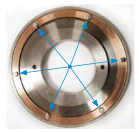
Fix the screws tightening torque of 3,4 Nm.