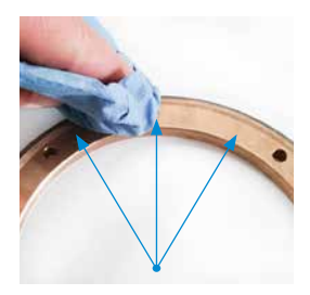
Carefully clean the contact surface of the HYLAS wheel.